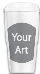
$16 D16390 24oz Acrylic Travel Tumbler