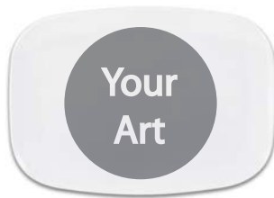
$18 D2500 Melamine Platter 10" x 13.75"